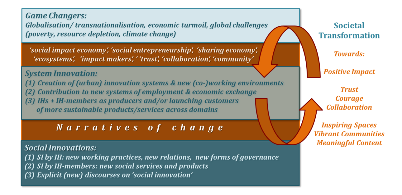
Figure 3: Five Shades of Change and Innovation by/at the Impact Hub

in different local, national and regional contexts. Underlying such different interpretations, are the globally shared values and Hub Experience propositions as introduced earlier. So besides the vision of a different economy, there is also a shared sense of direction towards a society in which there is more 'trust', 'courage' and 'collaboration', and a shared vision of a future that harbours more inspiring spaces, more vibrant communities, and more meaningful content.